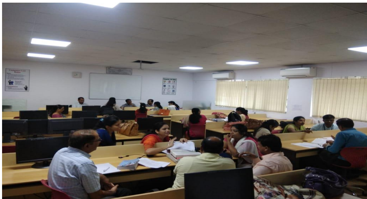
Discussion on various Semester VII subjects in the orientation meeting