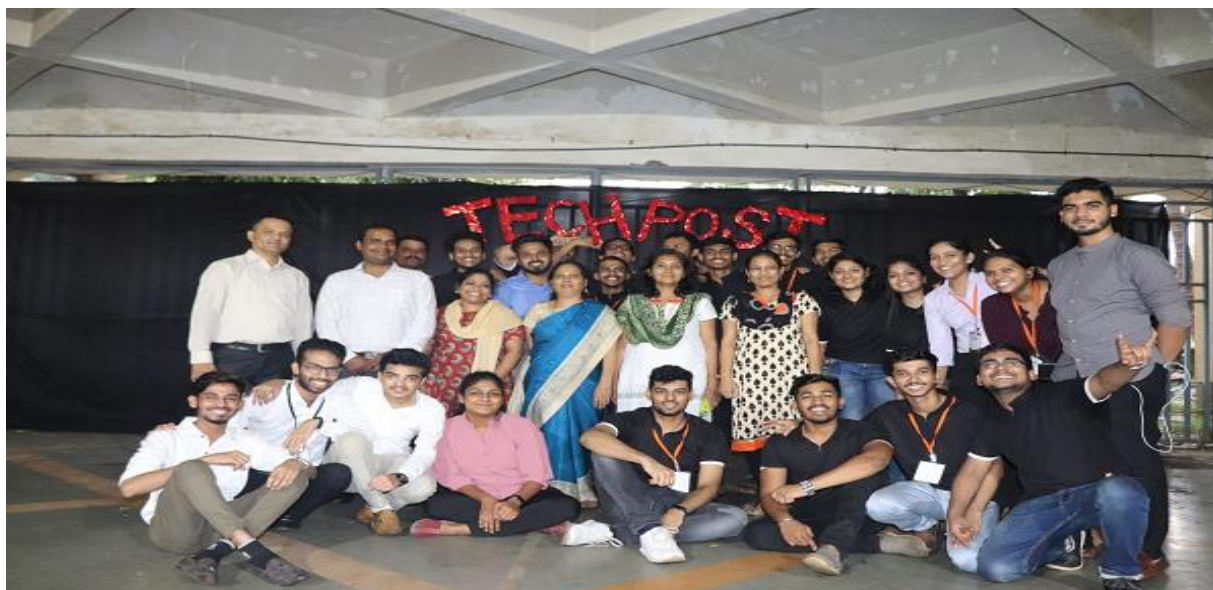
TECHPOST -2019 team- All faculty members and student volunteers from Department of Chemical Engineering