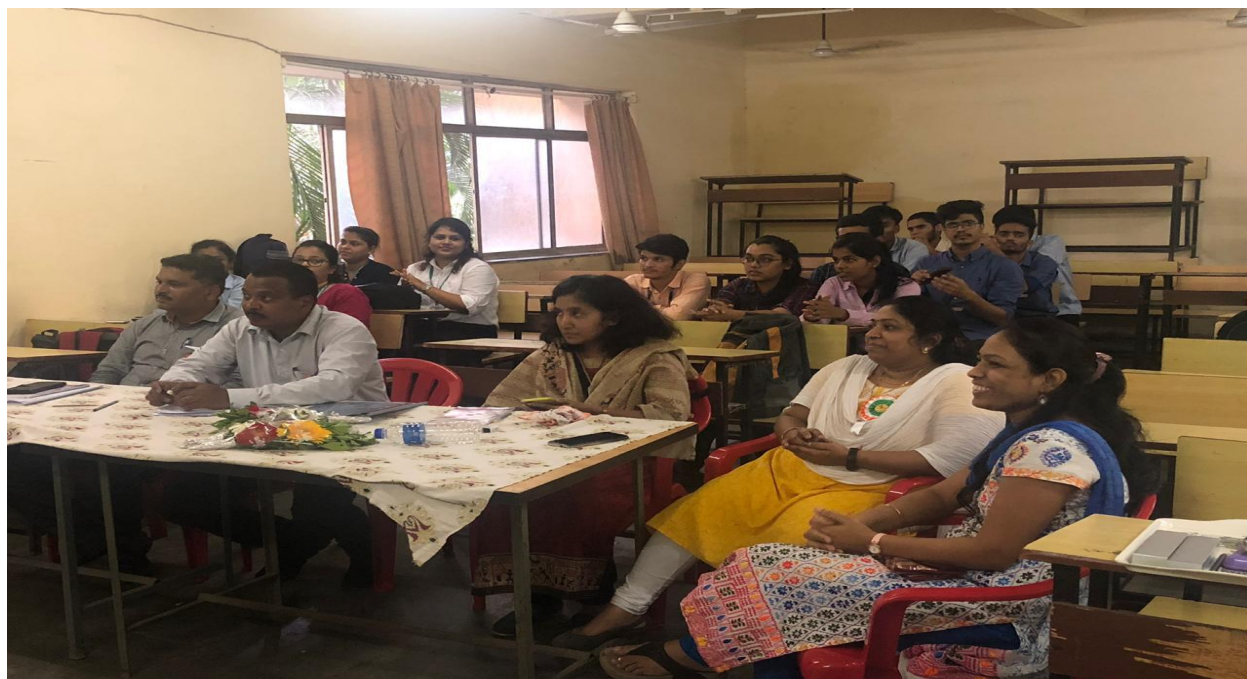
Paper presentation session with judges and participants during NLTPP