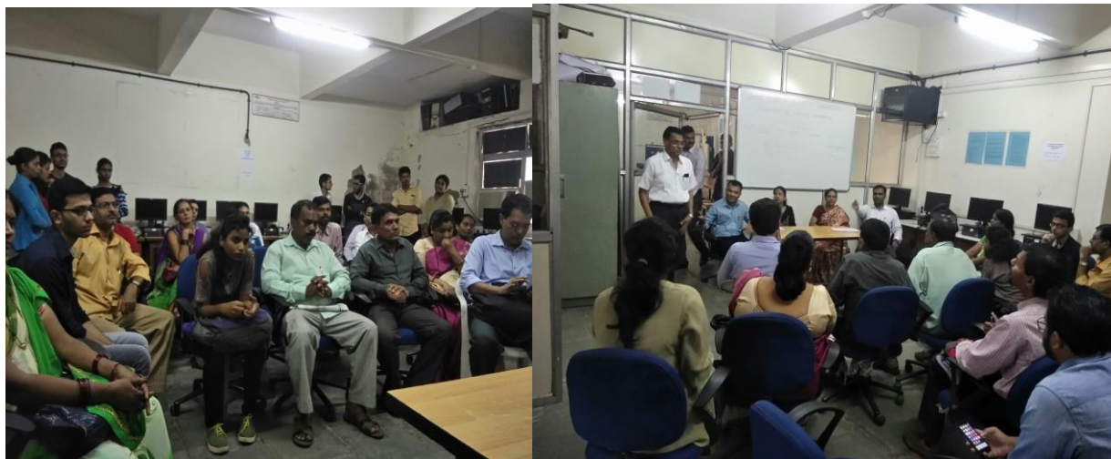
Parents-Teacher Meet -2019