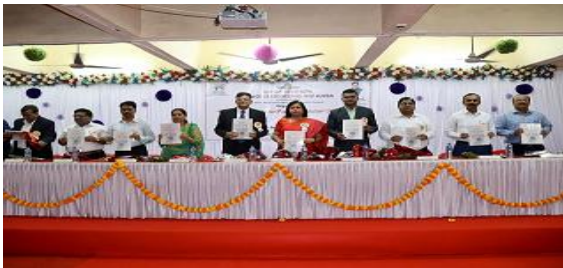
Opening Ceremony of NLTPP 2019