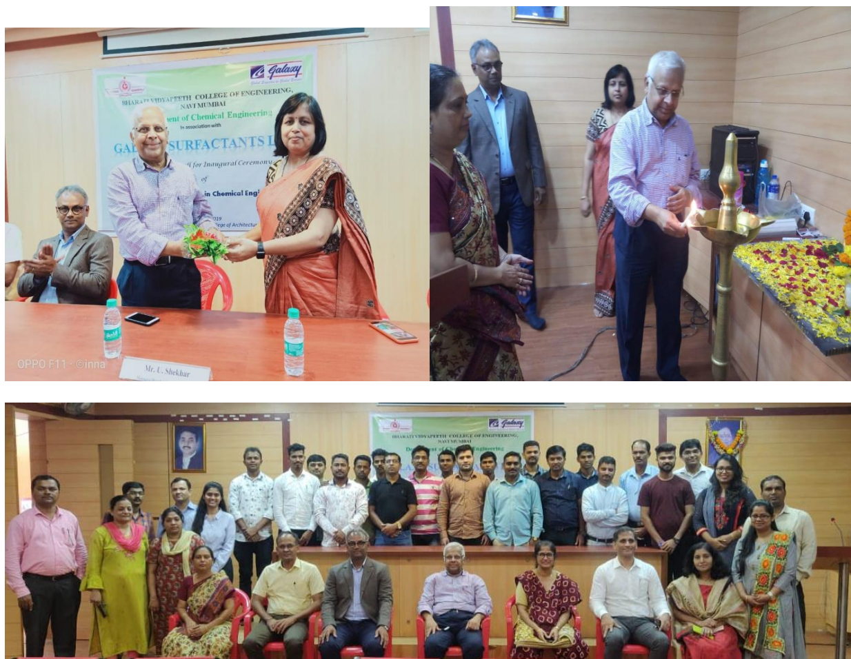
Inauguration ceremony , Certification course in Chemical manufacturing.