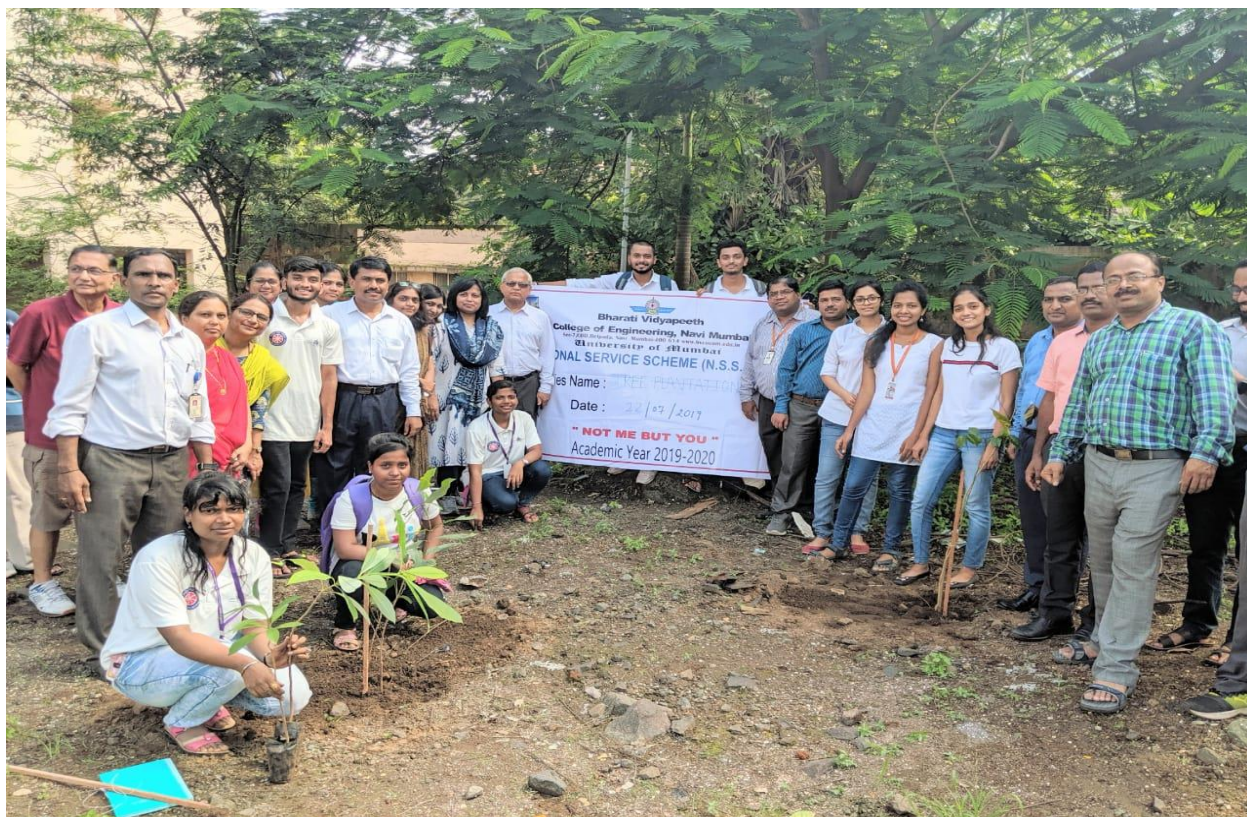
Tree plantation at Bharati Vidyapeeth, CBD, Belpada, Campus