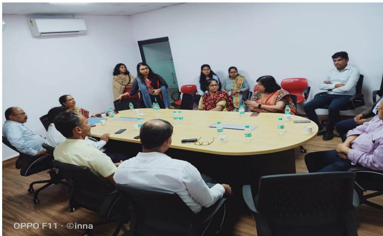
Discussion during Department Advisory Board Meeting