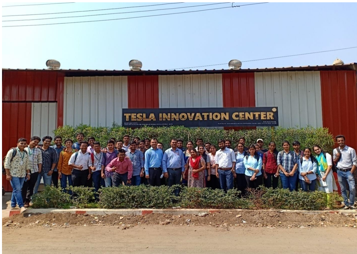
BE Students, Faculties and Experts from TESLA at TESLA INNOVATION CENTER