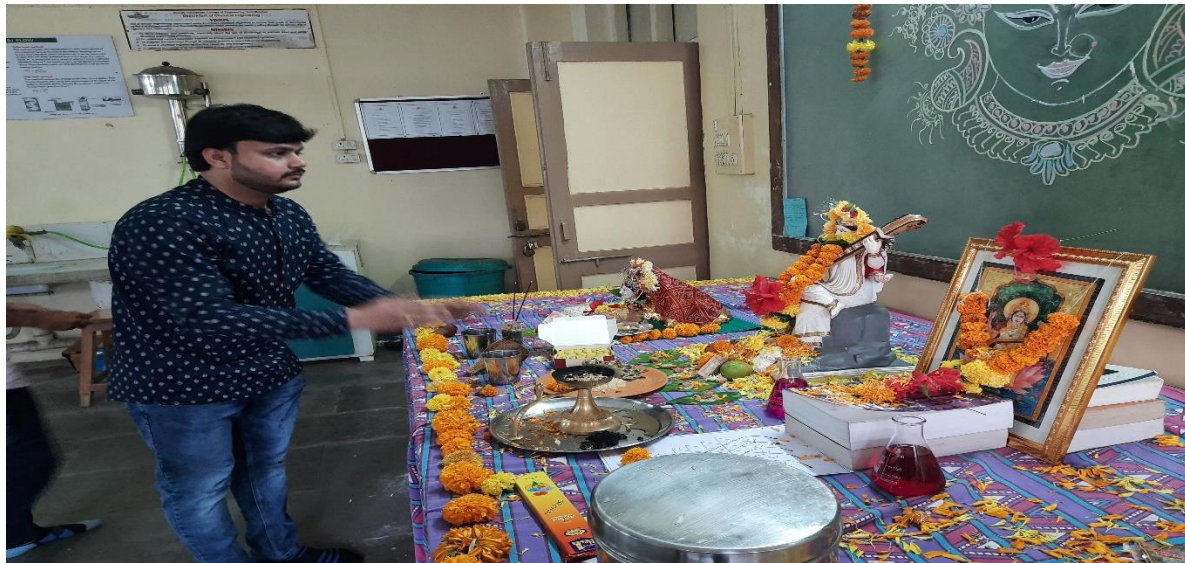
Dasera Function 2019